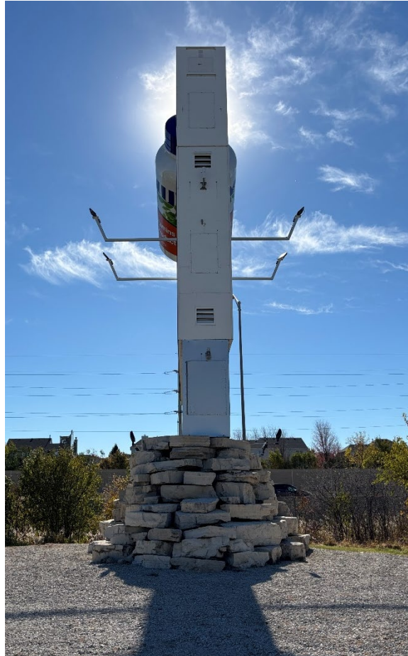
North Façade showing sign cabinet access points.