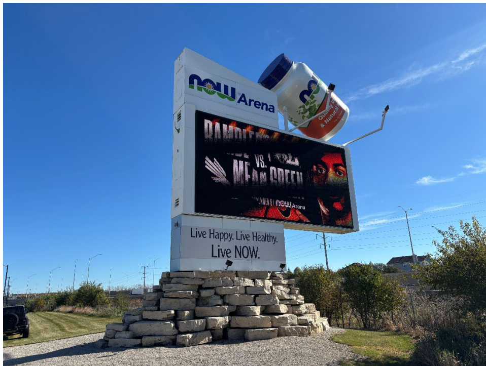
Sign and Display Panel West Façade.