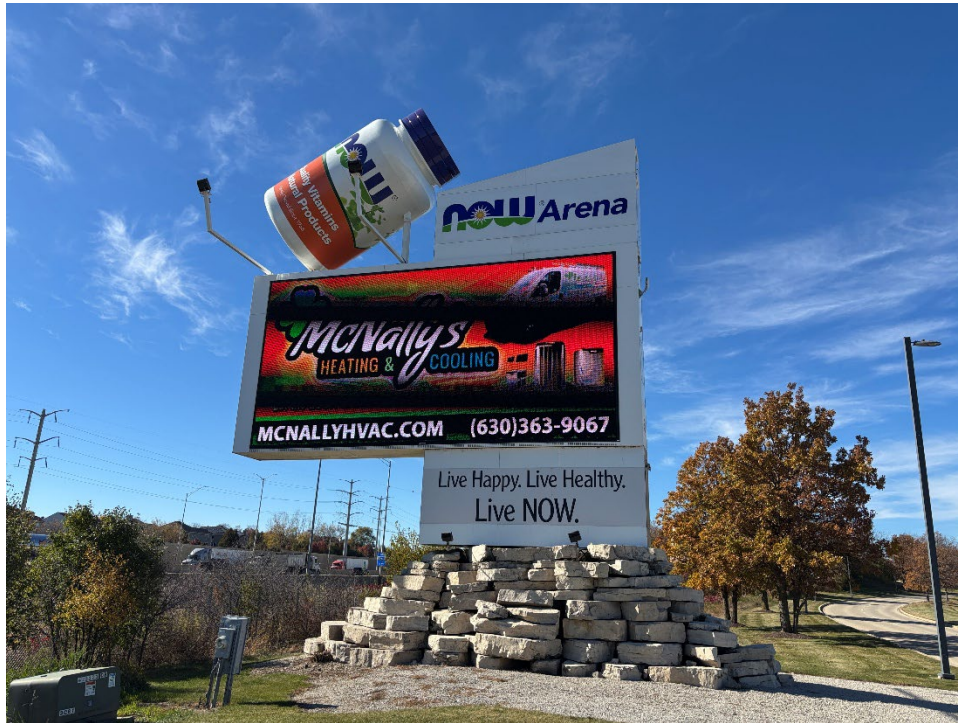
Sign and Display Panel East Façade. Electrical meter and service pedestal Southeast of sign.